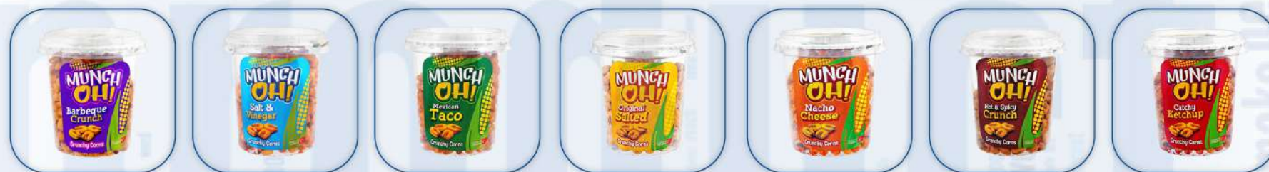
MUNCH OH! CORNS