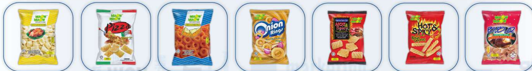
MIAOW MIAOW PRODUCTS