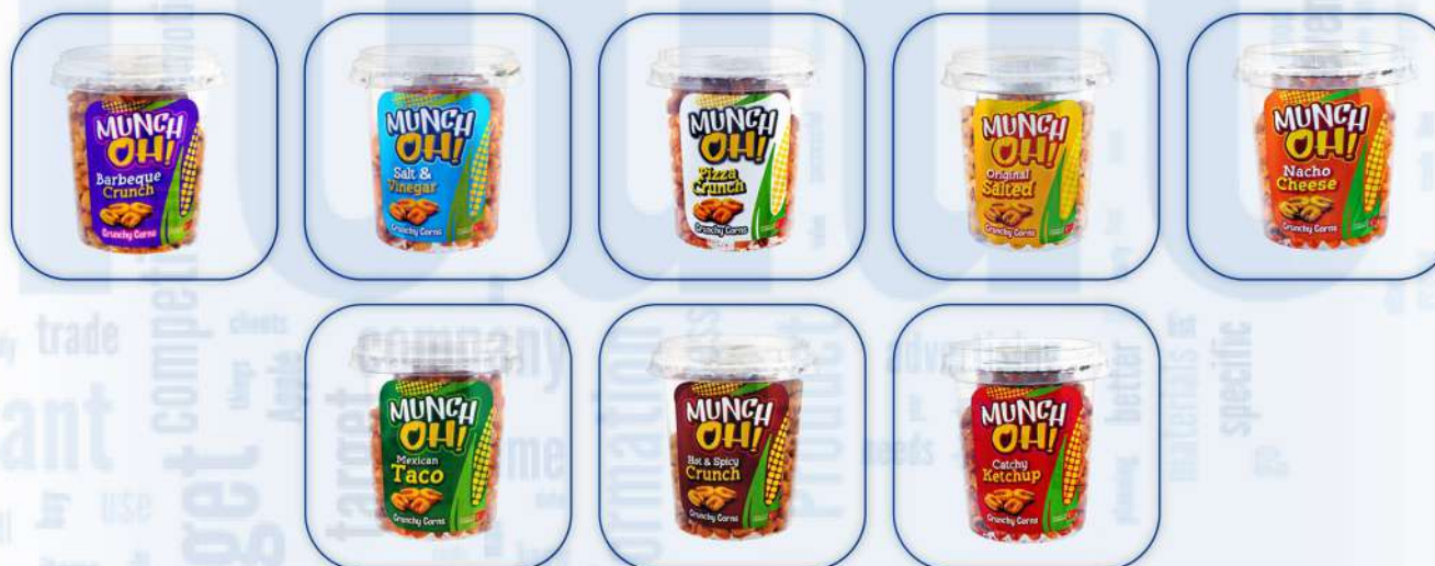
MUNCH OH PRODUCTS

IMPORTER & DISTRIBUTOR OF LEADING FMCG BRANDS FROM AROUND THE WORLD