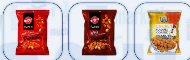
DESA SOUTHERN PRODUCTS