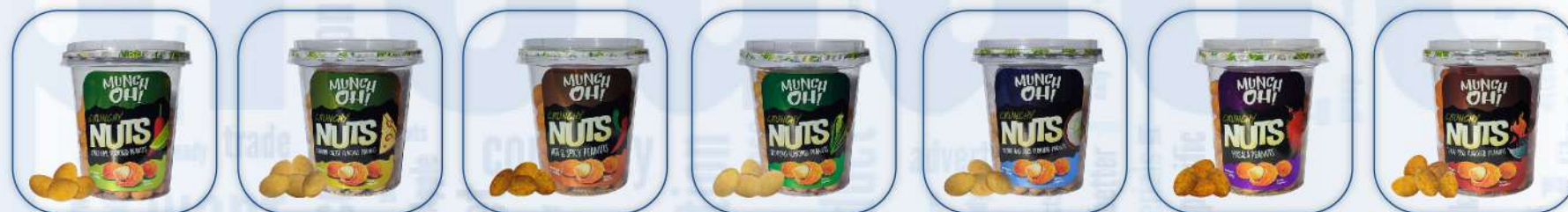
MUNCH OH! PEANUTS